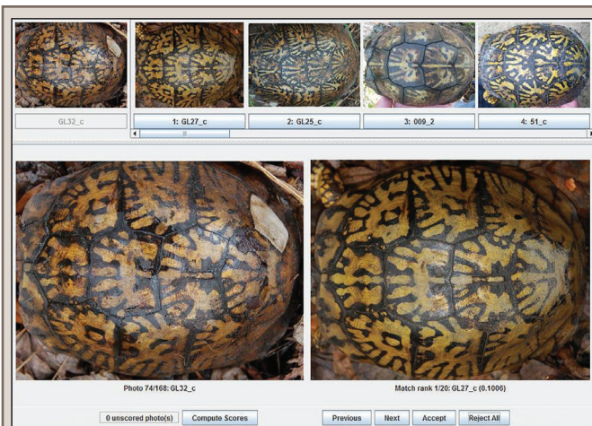
FIG. 1. User interface of WildID showing the focal image (bottom left and first in the row along the top), the active comparison window of the top-ranked marching score (bottom right), and the ranked potential images (top row). Note the loss of pleural scute 4 in the recapture image (active comparison window).